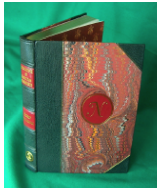
Leatherspine and corners with hand-marbled paper boards