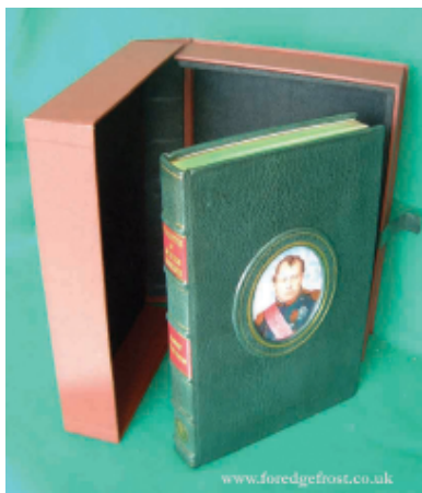
Luxury Full Leather with inset miniature under glass, in a tailored protective case.

D O you have a treasured book that means something very special to you? Why not have it bound in luxurious gold-tooled leather. There is a timeless quality of the look and feel of a fine, handcrafted leather bound book. It is pleasing to touch, durable, looks wonderfully elegant and makes a specially perfect Presentation gift. Choose from full to part leather, with gold tooling and gilded page-edges. Hand-marbled endpapers, protective cases and personalised presentation labels are available and also a repair service for 'poorly' books too.