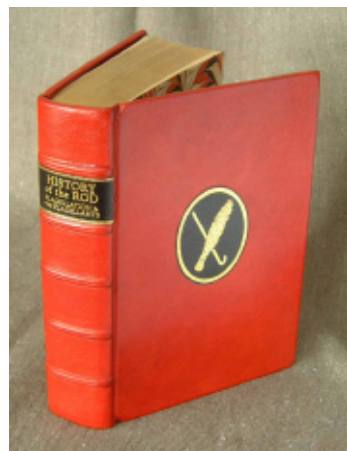
Luxury Full Leather with gold page-edges and hand-marbled endpapers