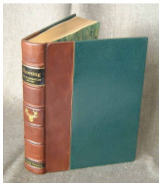
Leatherspine and cloth boards